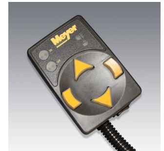
Easy-to-use touch pad controller.