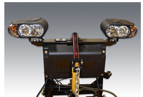
Top-of-the-line Nite Saber® III lights improve night vision. Commercial-grade encased hydraulic system provides responsive control.