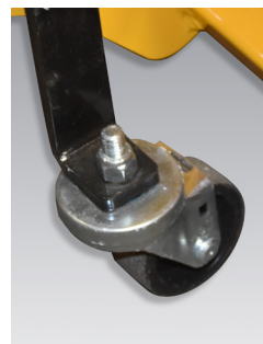
Caster wheels for easy maneuverability.